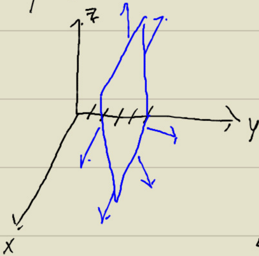
PLANE AT y=5